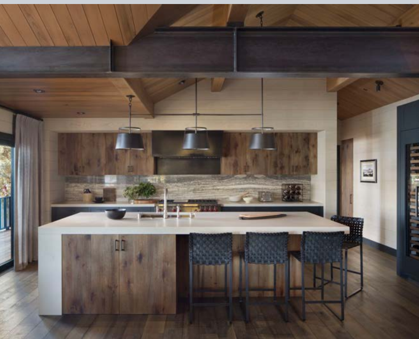
A travertine slab used for the kitchen backsplash features veining intended to echo the ridgelines of the surrounding mountains