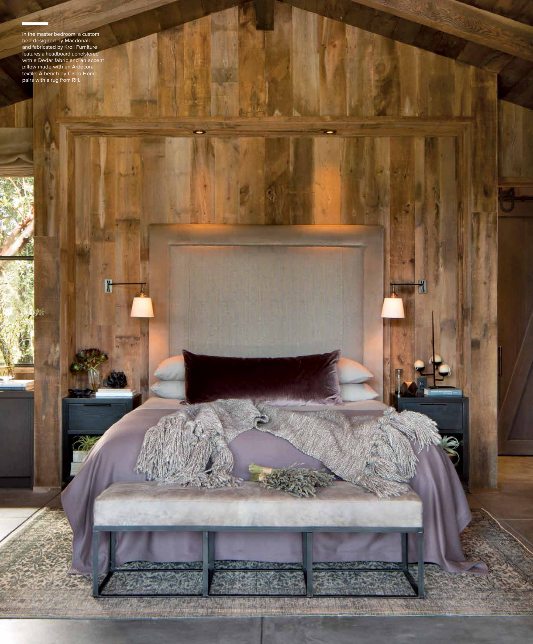
In the master bedroom, a custom bed designed by Macdonald and fabricated by Kroll Furniture features a headboard upholstered with a Dedar fabric and an accent pillow made with an Ardecora textile. A bench by Cisco Home pairs with a rug from RH.