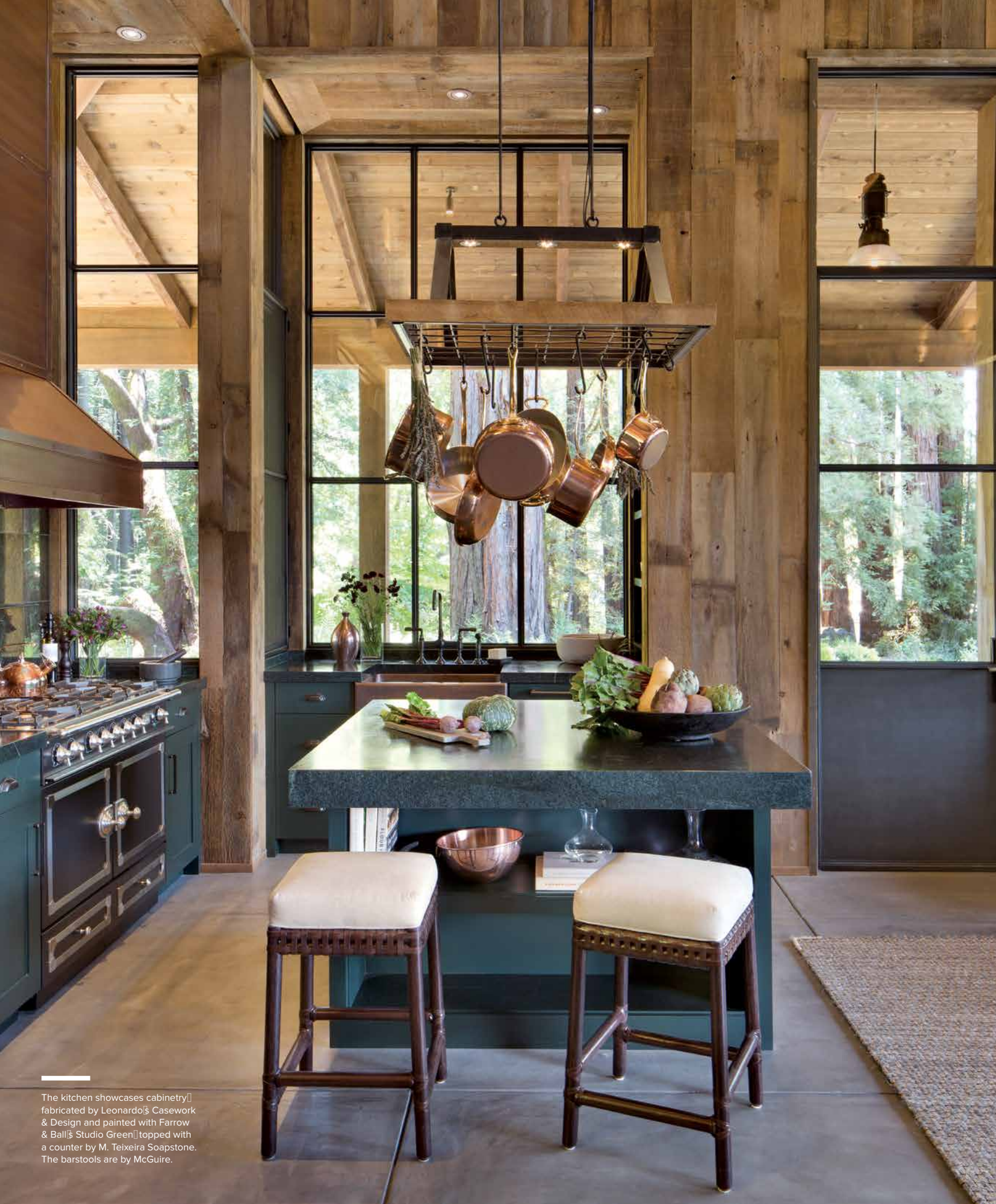
The kitchen showcases cabinetry fabricated by Leonardo's Casework & Design and painted with Farrow & Ball's Studio Green, topped with a counter by M. Teixeira Soapstone. The barstools are by McGuire.