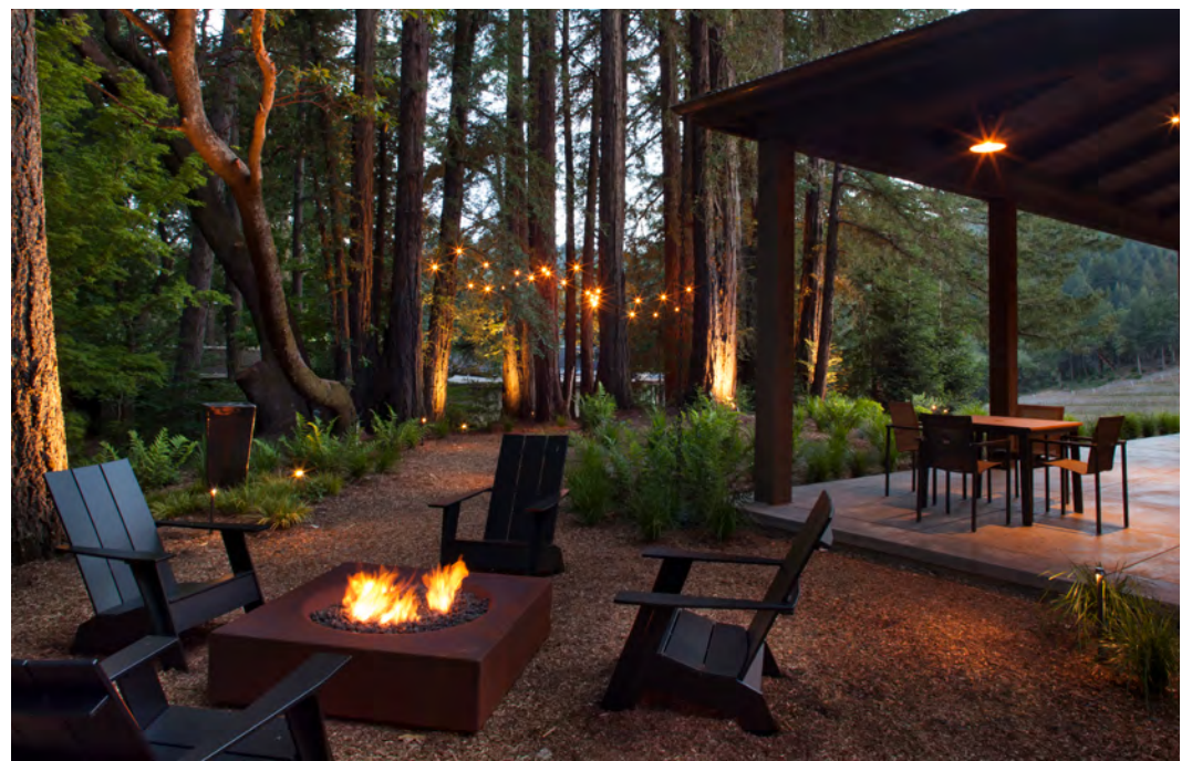
LEFT: An outdoor fireplace anchors the wraparound porch and overlooks a garden terrace nestled into the hillside below.