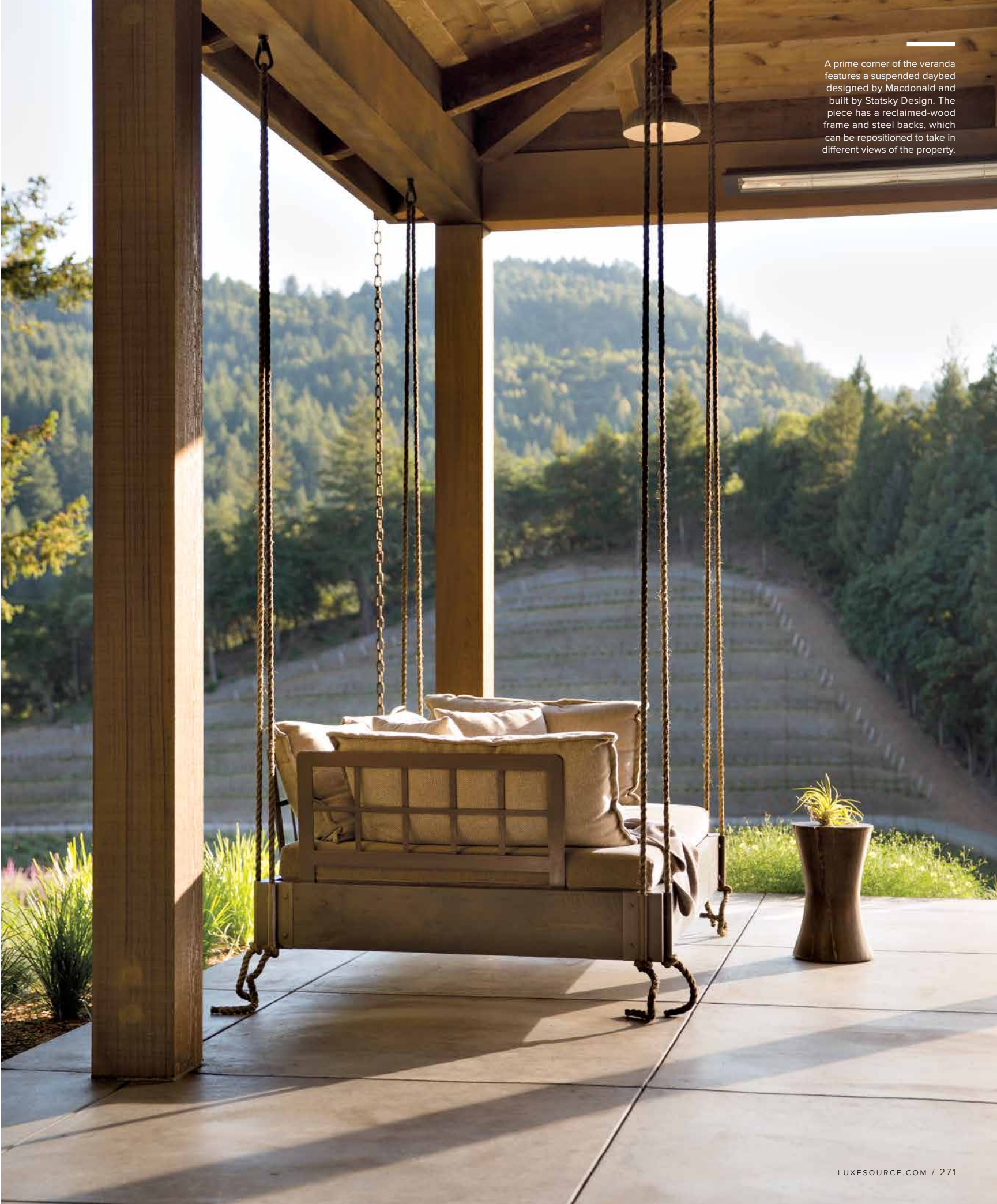
A prime corner of the veranda features a suspended daybed designed by Macdonald and built by Statsky Design. The piece has a reclaimed-wood frame and steel backs, which can be repositioned to take in different views of the property.

strict guidelines for square footage, Wade opted to create a feeling of spaciousness by encouraging as much light inside the house as possible. Within textured exterior walls crafted of patinated board-on-board red cedar, Douglas fir and native stone excavated from the site, the architect maximized the use of glass, specifying 12½-foot-tall Jada windows and doors. In addition, he designed a light monitor, made of high clerestory windows, to bring dappled light down through the canopy of trees and into the house along its central spine. Within that light-filled shell, Wade and Macdonald, who are longtime collaborators and worked together closely on this project, chose the basic interior materials palette. "It was important to bring interior design in early so that all of the finishes and colors flowed seamlessly," says Macdonald. To that end, the duo wrapped the interior shell—walls, trim and the nearly 24-foot-tall vaulted ceiling—with reclaimed wood and then grounded the space with integral color concrete floors. Steel elements, including a massive central fireplace surround, play off the textured wood.